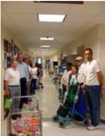
AGH Gift of Life Parade