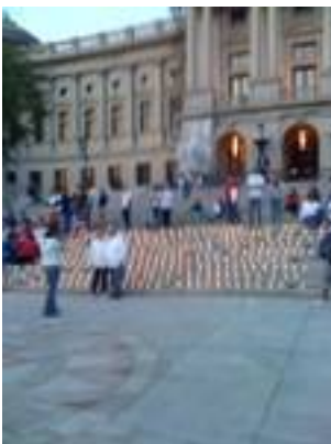
Candlelight Celebration Of Life Ceremony at the Capital Building in Harrisburg, PA