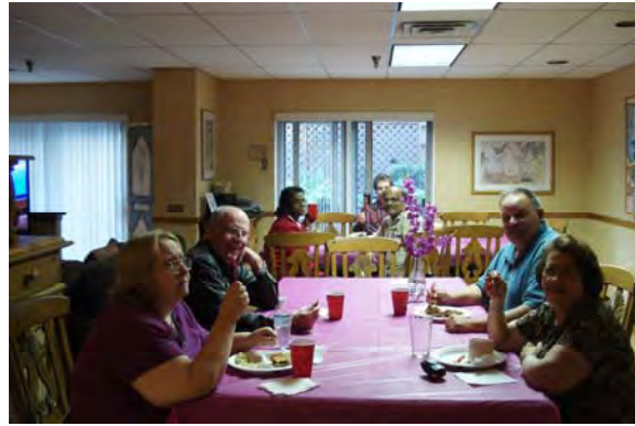
Family House Guests enjoying Dinner